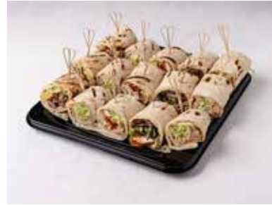
Kids Pizza Dough Wraps Serves 8-10/ 15 pcs - $105