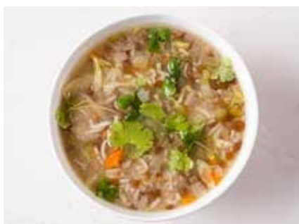
Lentil, Cabbage, and Rice