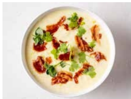
Corn & Pancetta Chowder