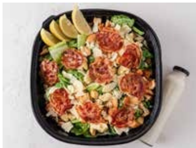
Kids Caesar Salad Serves 8-10/ $31