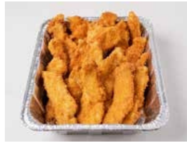
Kids Chicken Tenders Serves 8-10/ 15 pcs - $65