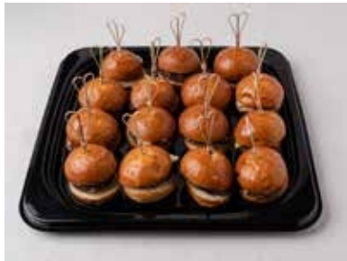
Kids Slider Burgers Serves 8-10/ 15pcs - $110