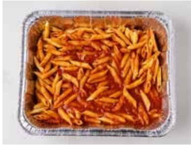
Kids Penne Pomodoro Serves 8-10/ $40