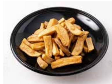
Kids Hand Cut Fries Serves 8-10/ $13