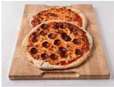
Kids Pizza Serves 8-10/ 2 pcs $25