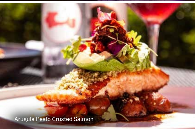
Arugula Pesto Crusted Salmon