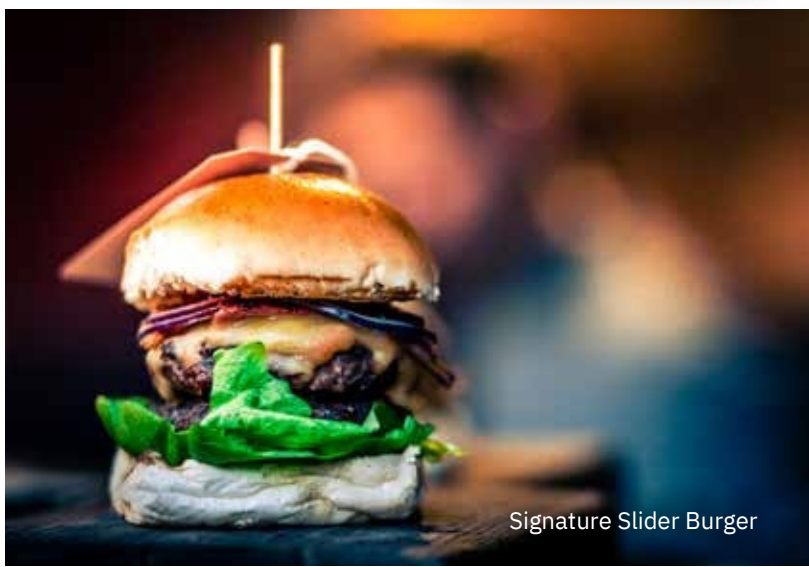
Signature Slider Burger