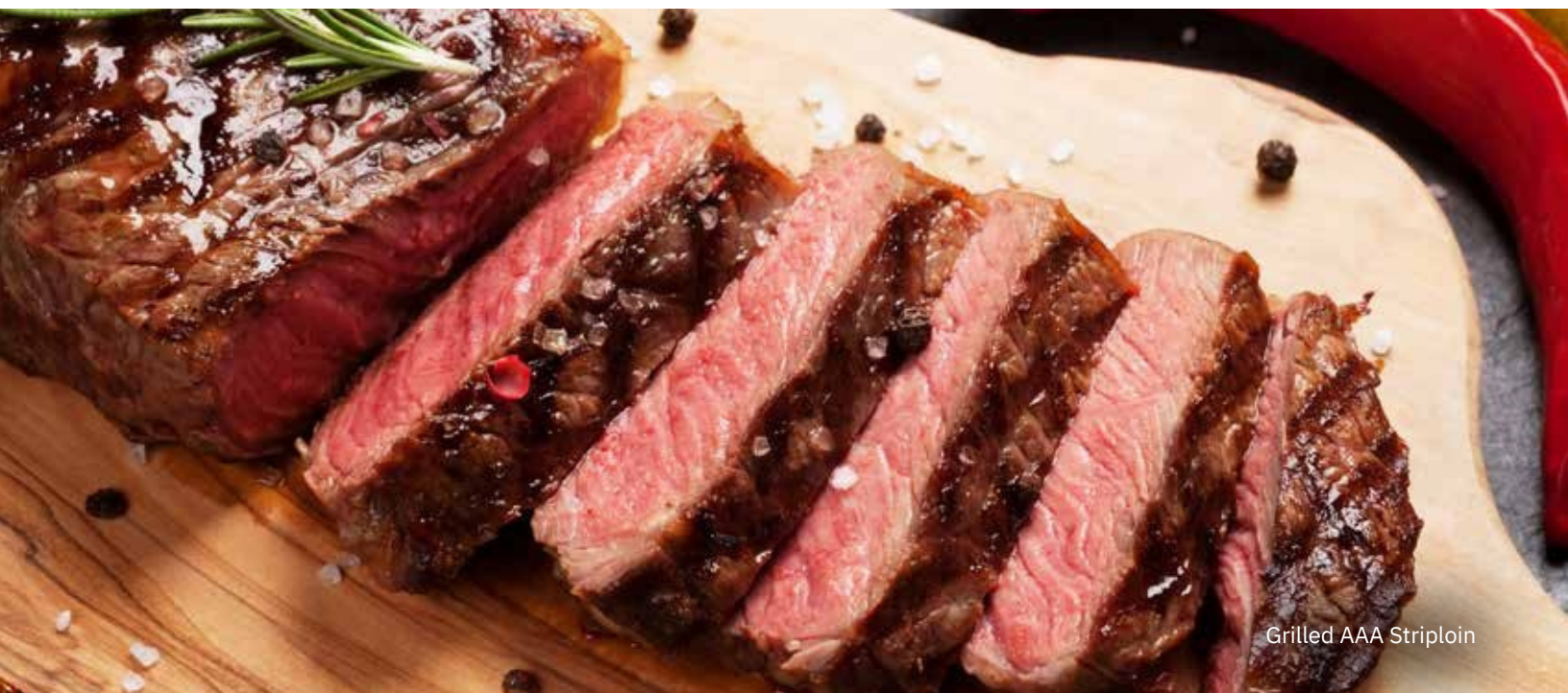
Grilled AAA Striploin