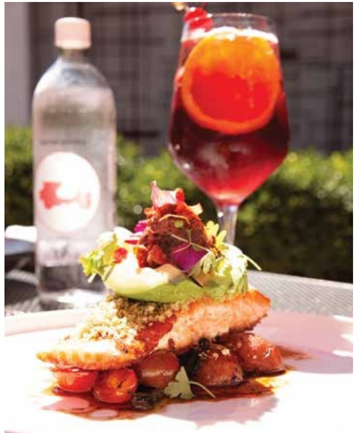
Panko Crusted Salmon Avocado Bruschetta & Red Italian Sangria.

Grilled seasoned octopus/ lemon, olive oil, garlic drizzle/ warm potato and crisp pancetta salad