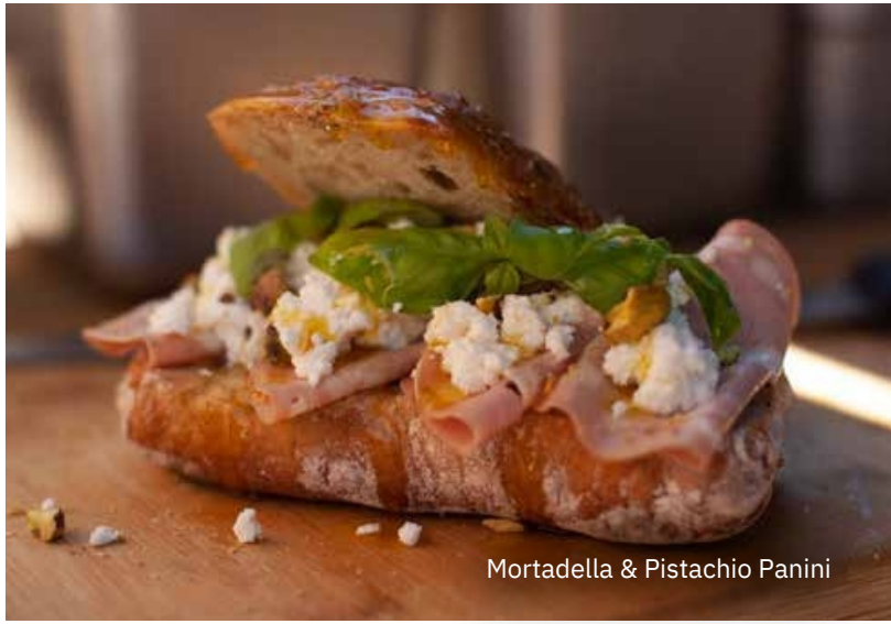
Mortadella & Pistachio Panini