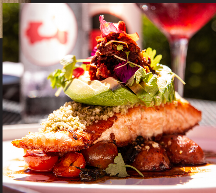
ARUGULA PESTO CRUSTED SALMON