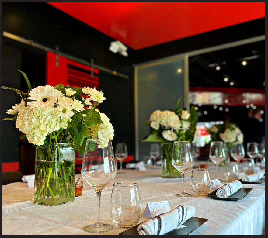
ROME PRIVATE DINING ROOM