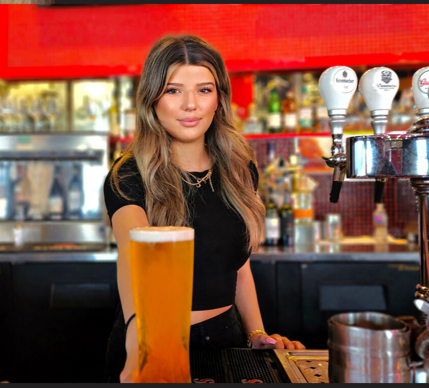
IMPORTED ITALIAN BEER